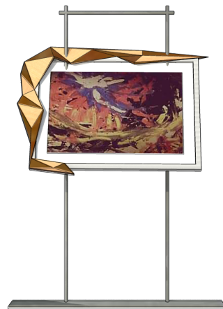
02-A two-toned wood w/ metal stand