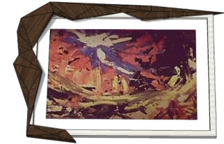
01-B single-toned wood frame