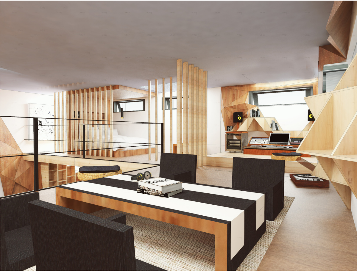
general loft area