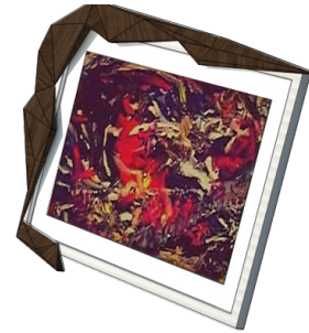
01-A single-toned wood w/ metal stand